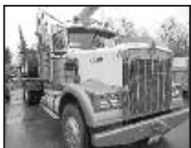
86 359 Pete, BC4 Cummins, 13 spd., nice hood Parting Out

W900B, BC3 Cummins, 15 spd., Miller trailer, air scales Parting Out