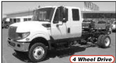
4 Wheel Drive

Sales - Financing - Service - Parts - Rentals - Body Shop - Salvage