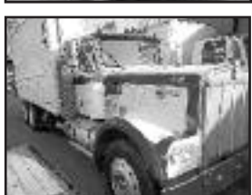
IHC 4300, BC3 400, 13 spd., 402 2 spds Parting Out

W900A, 3406B, 13 spd., nice enclosed lube body. Parting Out