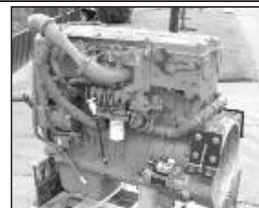
CUMMINS EGR ISX 485H.P. 2011 KW TRUCK LOW MILES - CALL