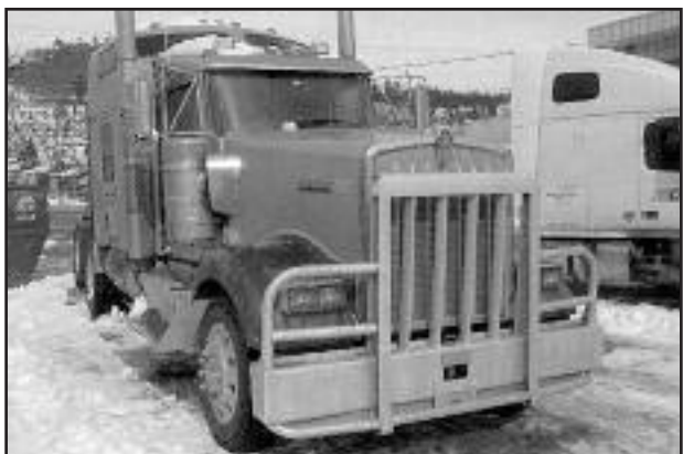
2012 KW W900, ISX 500 Cummins, 18- speed, Air Ride w/lockers ..... PARTING OUT