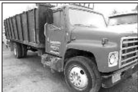
1989 S 1854, DT466, 18ft dumping bed Parting Out