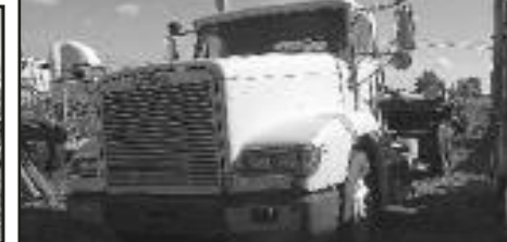
1999 Freightliner, series 60, 18 speed, long wheelbase ..... $12,500