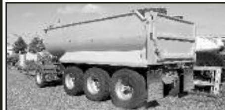
2000 4 Axle Pup Trailer with full turntable on front axle. Very good condition ..... $25,000