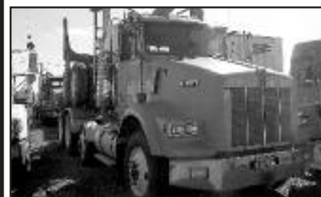
1993 KW T-800, N-14, 13 speed with 2 speed Eaton rear ends, 4 axle with 1993 Peerless electric scale trailer... $29,500