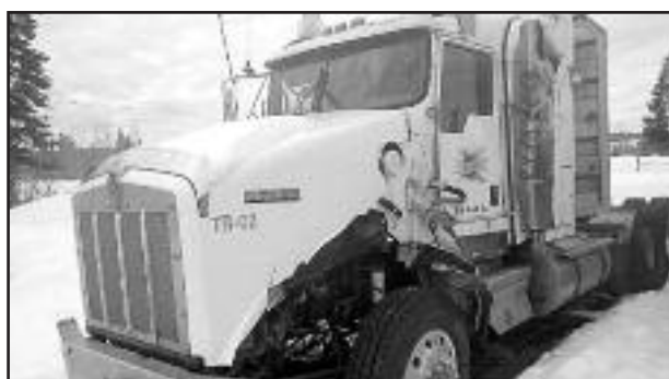
2009 KW T800 Short Sleeper Cab, C15 475, 18-spd., D40-170's dbl lockers, Hendrickson Primax, 20K front axle ..... PARTING OUT