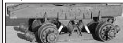
Air Liner, Hendrickson HN, Hendrickson Air, Kenworth 8-Bag, Air Trac, Neway