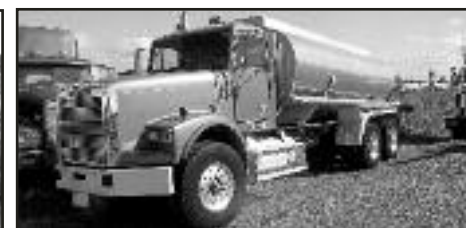
1993 Freightliner, 255,000 miles, Series 60 Detroit, 08LL transmission, double lockers, 3/8" steel frame with or without 3,800 gallon Beall tank ..... $39,500