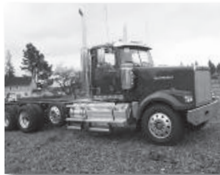
2014 Western Star 4900EX - Logger - NEW DD15 560HP, RTLO-18918B, TufTrac Suspension, Wheelbase 262", Two 60 Gallon Tanks