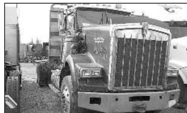
2000 KW T800 High Hood, N14 525 Cummins, Fuller 18-spd., DS463's 4.33 AG/400 w/lockers ..... PARTING OUT