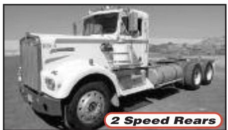
2 Speed Rears

1989 KENWORTH W900 , CAT 425HP, Jakes and BrakeSaver, 18-Spd, 12k Front, 40k Rears, 3:90 Ratio, Air Susp, 255" WB, Peerless Trailer, Vulcan Scales, Quick Change Air Slide, Hyd Wet Kit, Engine-Trans-Rear Diff Overhaul..... $34,500 Package