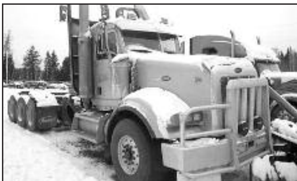
2007 Pete 378, ISX 565 HP, RTLO18918B, 69K Tri/Drive, lockers, Air Ride ..... PARTING OUT