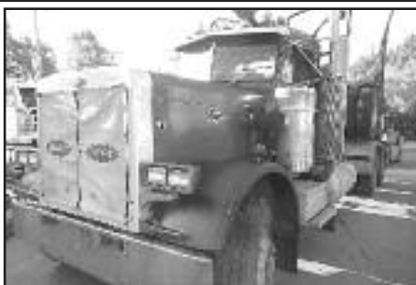
1984 359, 3406 Cat, 13 spd, Rockwells Parting Out

W900B, BC3 Cummins, 15 spd., Miller trailer, air scales Parting Out