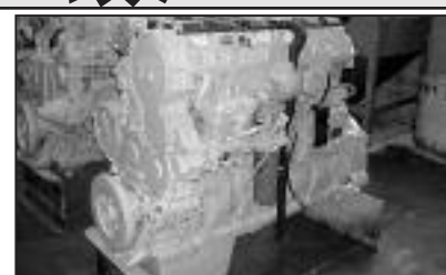
CAT C-15 475 W-JAKE SEVERAL TO CHOOSE FROM $9,500 TO $12,500