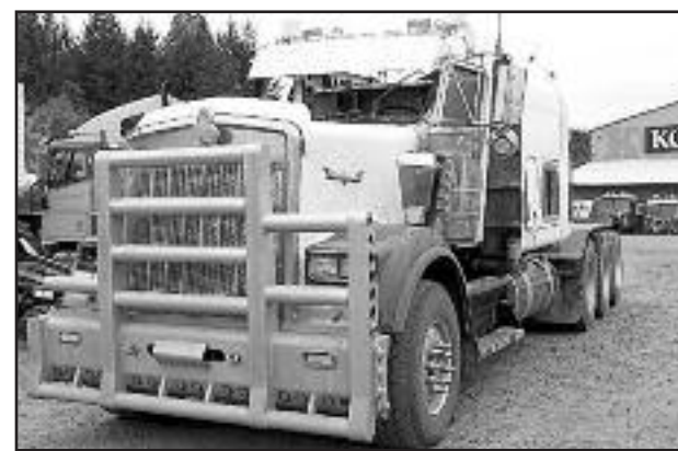
2010 KW W900B, ISX 550, RTLO18918B, 69K tri/drive AG400..... PARTING OUT