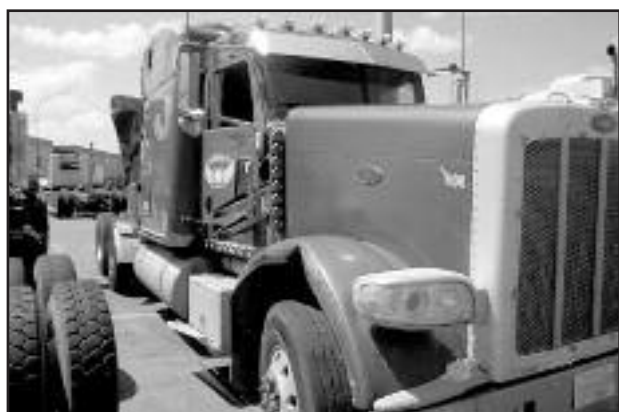
2010 Pete 388, ISX 550, RTLO18918B, 40K rears/lockers ..... PARTING OUT

800 Numbers for WASHINGTON, OREGON, IDAHO, MONTANA • WE HAVE WHAT YOU NEED - CALL US!!