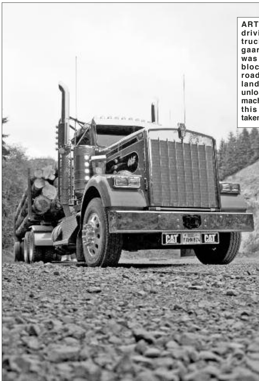
ART TOLBOL, driving dump truck for Nygaard Logging was briefly blocking the road out of the landing while unloading some machinery when this photo was taken.