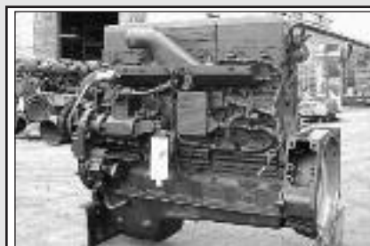
SPECIAL N-14 Cummins Celect+, 460-525 h.p.-Super Condition $6,500-$8,500