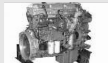
2008 SER. 60 DEDEC VI SUPER LOW MILES - CALL!

"SPECIAL" DT466 3208T CAT 5.9 - 8.3 CUMMINS CALL