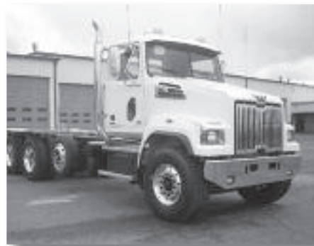
2013 Western Star 4700SF - Day Cab - NEW DD13 450HP, RTO-16908LL, Engine Brake, TufTrac Susp., Wheelbase 226", 80 Gal Tank