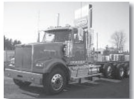
2014 Western Star 4900SF - Logger Chassis DD15 560HP, RTLO-18918B, Engine Brake, TufTrac Suspension, Two 80 Gal Tanks